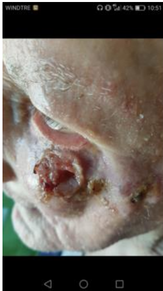
Baseline Jan 2020