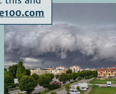
No hurricane was able to form under a similar cloudburst with DPE.