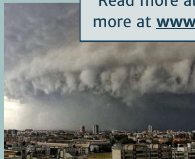
Hurricane without DPE July 10, 2019, Italy.

Read more about this and more at www.dpe100.com