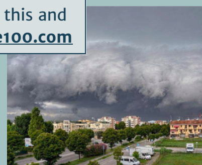
No hurricane was able to form under a similar cloudburst with DPE.

To find your DPE store, visit: stores.agohealp.com For further inquiries, email contact@dpe100.com