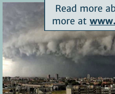
Hurricane without DPE July 10, 2019, Italy.

Read more about this and more at www.dpe100.com