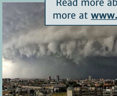
Hurricane without DPE July 10, 2019, Italy.

Read more about this and more at www.dpe100.com