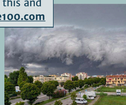
No hurricane was able to form under a similar cloudburst with DPE.

To find your DPE store, visit: stores.agohealp.com For further inquiries, email: contact@dpe100.com